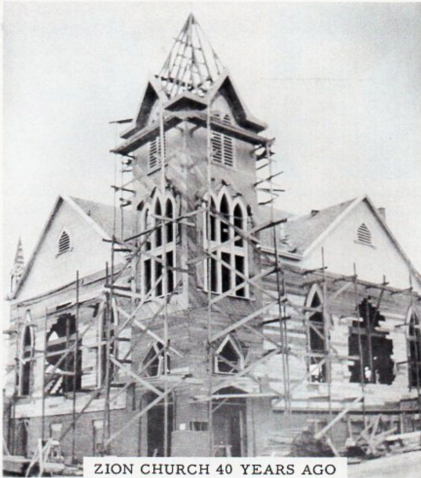
ZION CHURCH 40 YEARS AGO