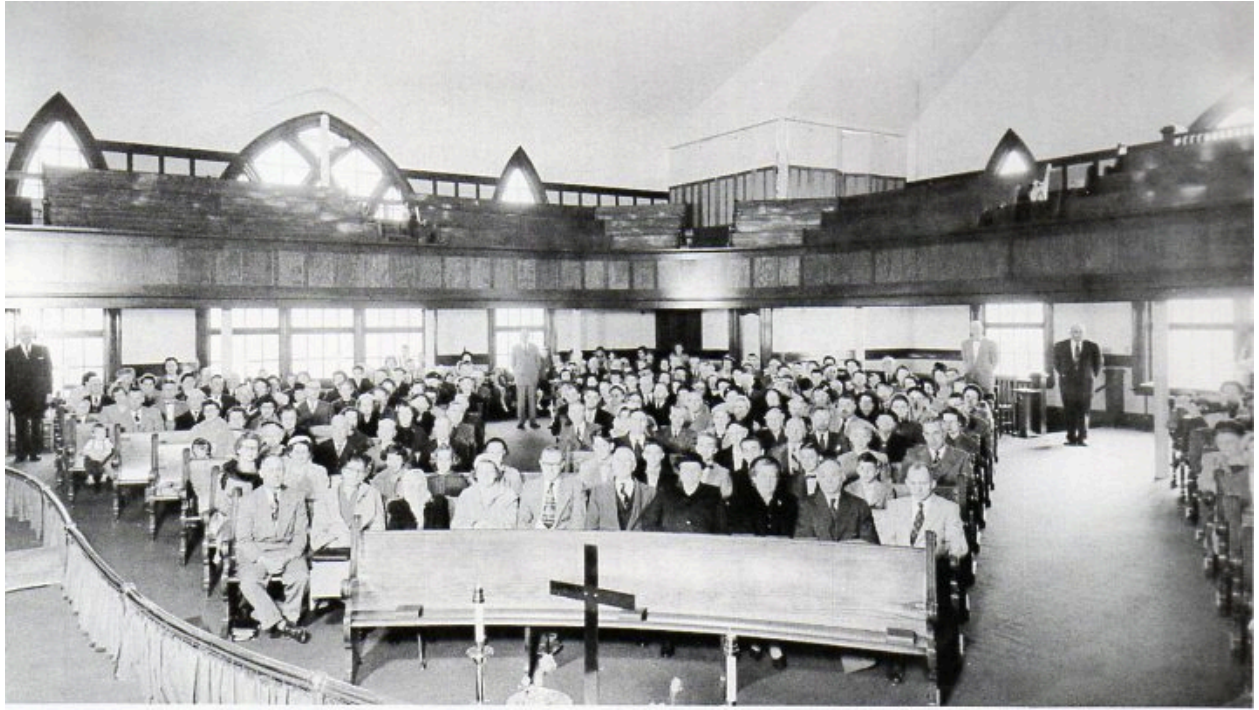
Interior view of the church with part of the congregation