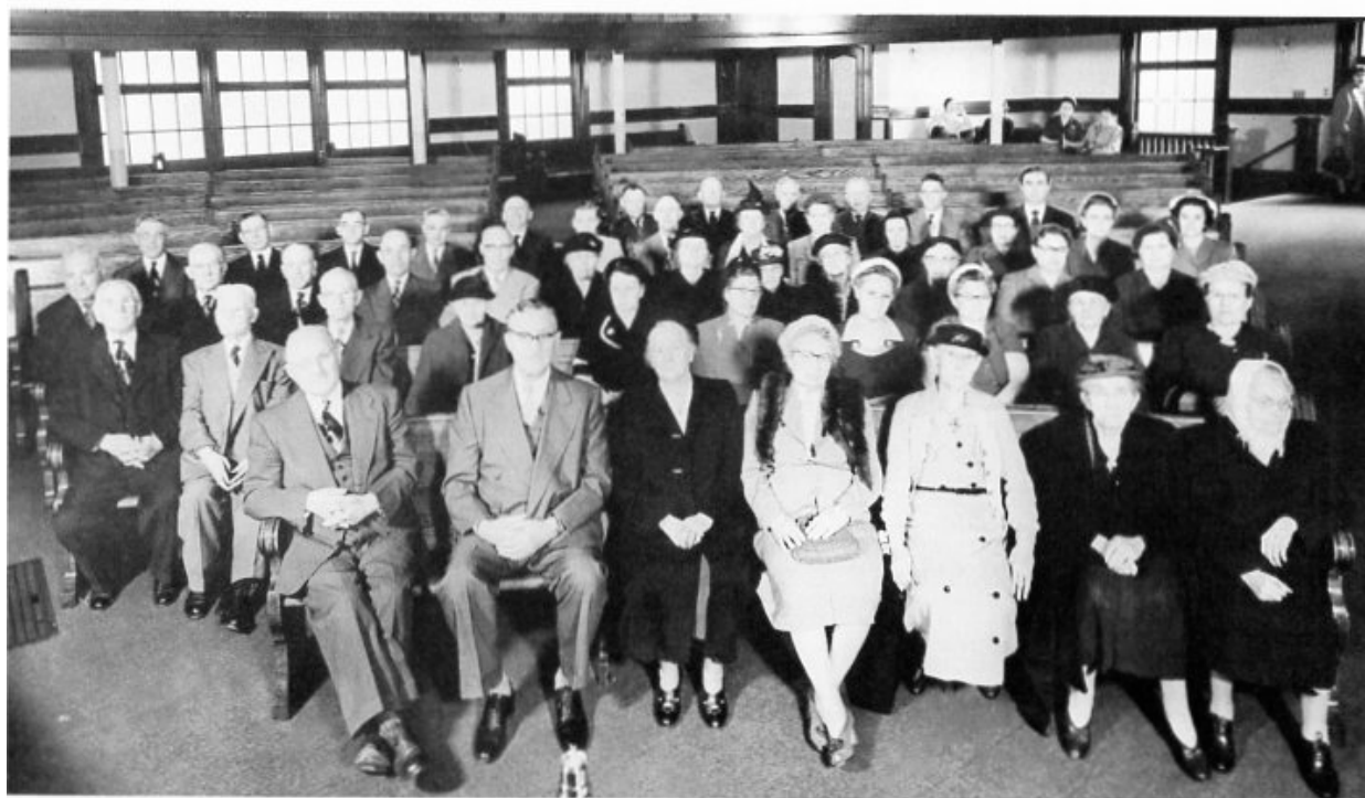
THE ZION PRAYER GROUP