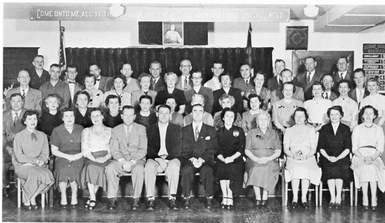
THE ZION FELLOWSHIP CLUB