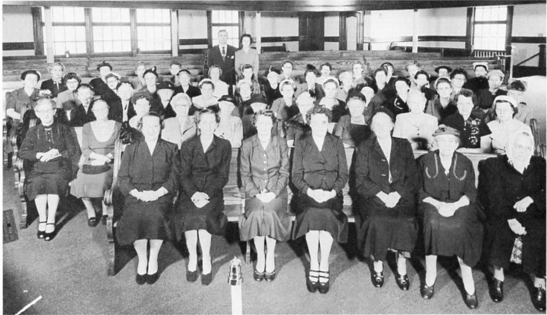
THE ZION LADIES AID