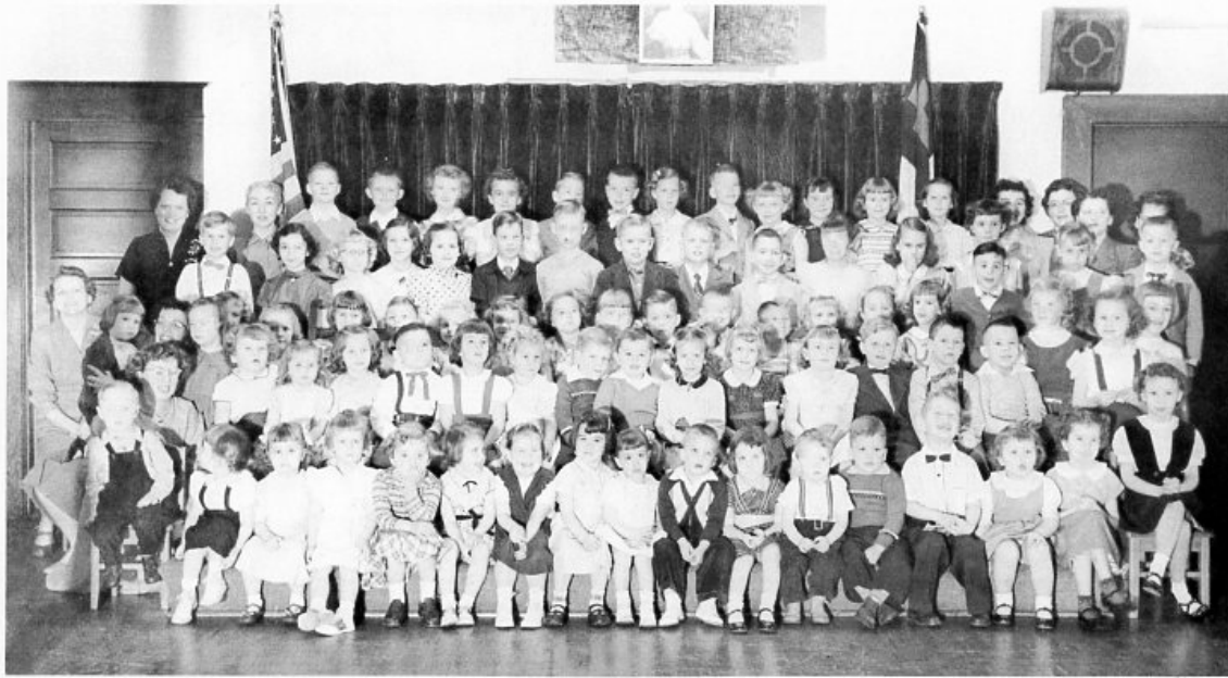
ZION SUNDAY SCHOOL Nursery, Beginner & Primary Departments.